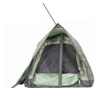
Foot end pole